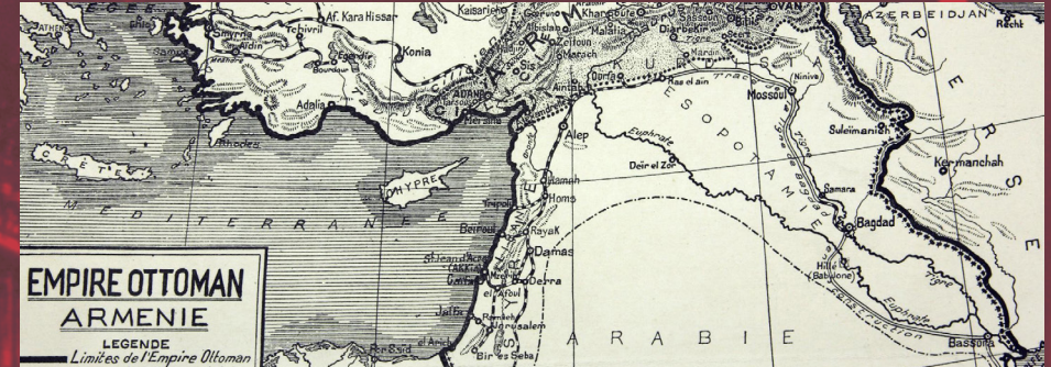
The collection includes a series of high-resolution maps detailing the changing boundaries of Europe and the Middle East in the inter-war years.