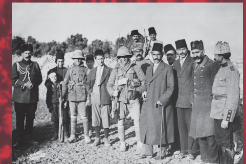
...and the dissolution of the once mighty Ottoman Empire.

Over 3 million records covering 1000 years of world history: from politics & warfare, to slavery & revolution.