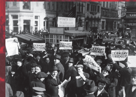
It also sheds light on the precipitous decline of German power and influence...