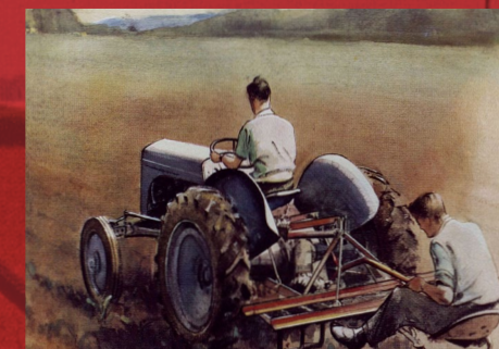
Later issues explored the development of new working practices in British agriculture, as well as the incorporation of digital technology.

Over 4 million records covering 1000 years of world history: from politics & warfare, to slavery & revolution.