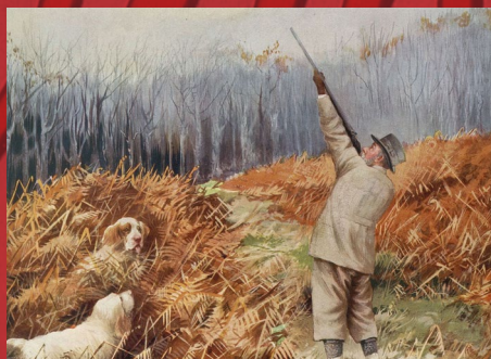
Founded in 1874, The Illustrated Sporting and Dramatic News became one of several titles owned by The Illustrated London News .

Despite its focus on sports and country living, The Illustrated Sporting and Dramatic News also printed many articles on theatre, opera, literature, and music, with contributions from some of the most prominent artists of the day.