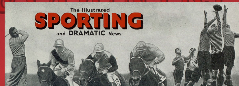
The magazine reflected the interests of the country's landowning classes, with articles on foxhunting, shooting, yachting, golf, and polo, as well as events such as the annual Oxford-Cambridge boat race, Royal Ascot, and the Epsom Derby.

...from cricket and golf to hunting and agriculture