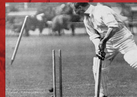
Earlier issues printed and discussed work by celebrated authors such as Bram Stoker and distinguished playwrights such as Noel Coward.

Sources include: Illustrated London News