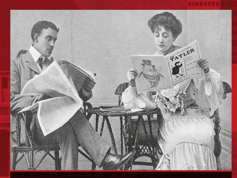
Until 1968, The Tatler was owned by the Illustrated London News (ILN).

Appearing on a weekly basis, and enduring two World Wars, this magazine kept its readership abreast of the latest developments in British High Society.