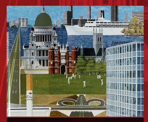
This collection contains over 250,000 images from more than 3,000 issues of The Tatler.

Focusing mainly on fashion, theatre, and sports (especially cricket and golf), The Tatler provided regular glimpses into the lives of the rich and famous, habitually regaling readers with news and gossip about Britain's most prominent socialites, including aristocrats, athletes, and actors.