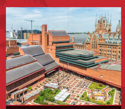
This collection was scanned from source at the British Library.

The COI and MOI were responsible for informing and influencing the British public on a wide range of issues. To this end, both worked with and on behalf of other departments and public bodies to design and produce appropriate publicity and propaganda materials.