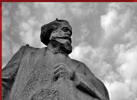
This collection is part of the British Communism at Home and Abroad, 1883-1991 series.