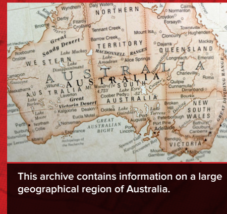
This archive contains information on a large geographical region of Australia.

This collection includes letters, journals and supplementary