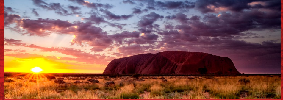
Aboriginal Australians spirituality is known as the Dreaming, which emphasises the ancestral significance of the land. The arrival of Europeans disrupted traditional ways of life and the indigenous population declined over the following centuries.