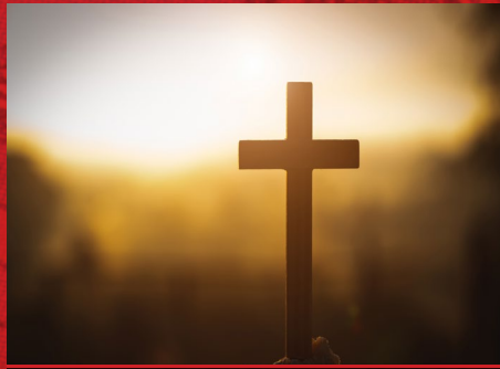
This collection is part of British Online Archives' Spreading the Word series.

From the 18th to the early-20th century, the USPG went by the name of the Society for the Propagation of the Gospel in Foreign Parts (SPG).