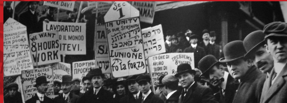
The Labour Party was founded in 1900 to represent the interests of trade unions and working-class voters. In political terms, it has often been characterised as a "broad church", encompassing a range of left and centre-left viewpoints.