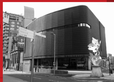
The collection was curated in association with the Manchester-based Labour History Archive & Study Centre.

The minutes provide an insight into the party's often divided outlook on several important domestic and international political issues, including: nationalisation of key industries; Britain's trade deficit; nuclear disarmament; Britain's relationship with Europe; the Falklands War; and the emergence of the Social Democratic Party (SDP) and New Labour.