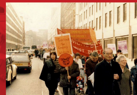
PLP meetings in this period touched upon a range of topics, such as Apartheid in South Africa and the miner's strike.

The collection is therefore useful for those studying the history of British political parties, social movements, and foreign policy in the 20th century.