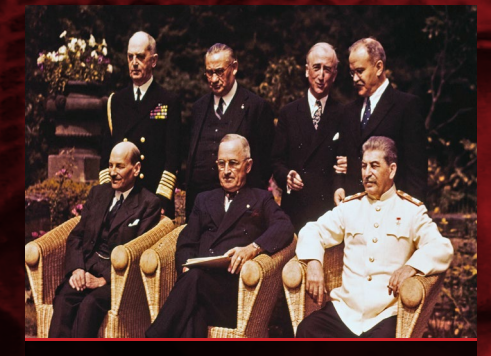
It contains more than 250,000 unique images.

The materials, which are diverse in nature, cover a wide range of subject matter, shedding light on the perspectives of various state and non-state actors during periods of both cooperation and conflict.