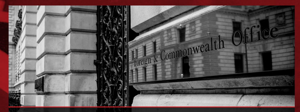
Most of the documents are derived from the annals of the British Foreign Office (i.e. FO 371), Cabinet Office (i.e. CAB 128), Treasury (i.e. T 274), and Board of Trade (i.e. BT 64).

the humanities and social sciences, from History and International Relations to Economics and International Law.