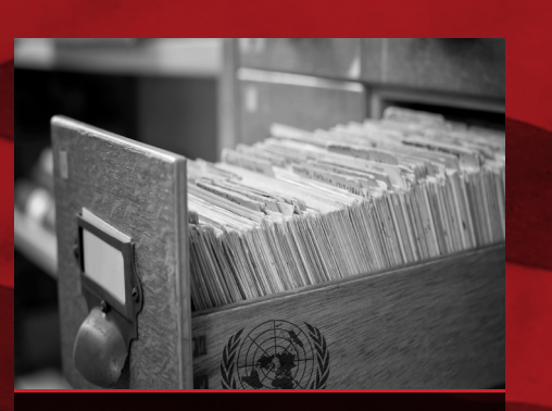
This collection was scanned from paper at The National Archives (UK).

While some found support on either side of the so-called Iron Curtain, others were very much the product of the West and its particular interests.