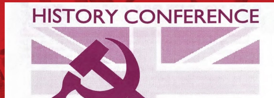
The final event featured in the collection, the History Conference, offered a revisionist assessment of the CPGB and precluded the liquidation of the party in 1991.