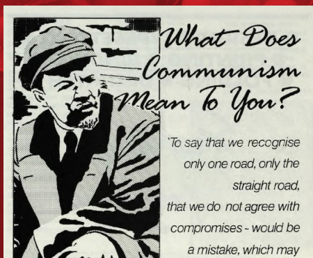
This short and easily navigable collection contains 824 images.

Most of the events occurred during the CPGB's twilight years, when factional in-fighting and ejection from the political mainstream were dominating the internal politics of the party.