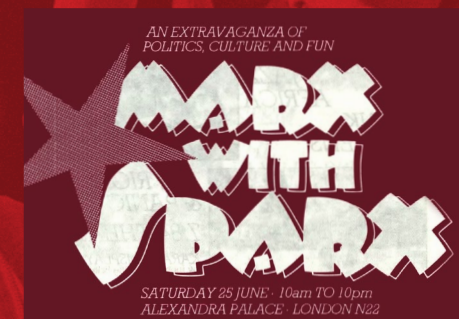
The content of CPGB festivals ranged from live music to athletic events to political talks.

“This Festival brings together people who think politics can be about fun and freedom and the future, who are fighting for those things in a myriad of different ways, who often disagree with each other profoundly but have in common the readiness to strengthen the links. As a way of going about things, it’s a sign of the new times in British politics.” Advertisement for The People’s Festival, 1978.