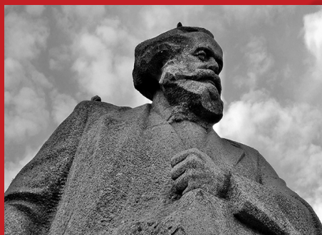
The collection is part of the wide-ranging British Communism At Home and Abroad series.