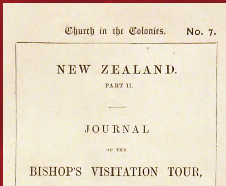
It encompasses more than 8,000 unique images.

Anglican missionaries first arrived in New Zealand and Polynesia in the 17th century, their mission was to spread the gospel to the indigenous Māori and Polynesians. The arrival of Europeans disrupted traditional ways of life.