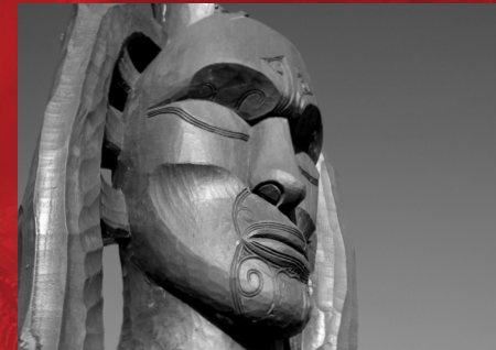
Documents from New Zealand, include descriptions of missionaries' early encounters with the indigenous Māori.