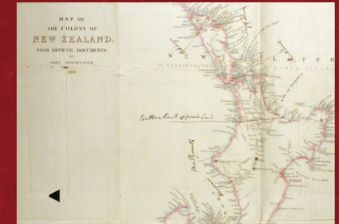
This collection includes a detailed map showing the Colony of New Zealand in 1841, by cartographer John Arrowsmith.

Over 4 million records covering 1000 years of world history: from politics & warfare, to slavery & revolution.