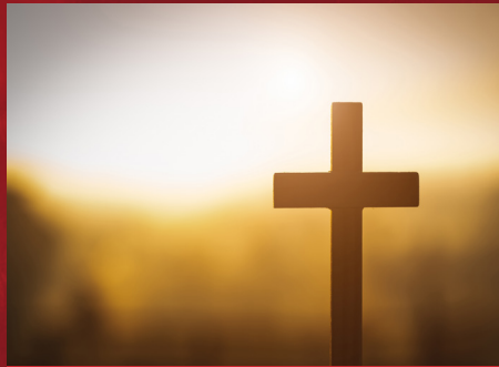
This collection is part of British Online Archives' Spreading the Word series.

From the 18th to the early-20th century, the USPG went by the name of the Society for the Propagation of the Gospel in Foreign Parts (SPG).