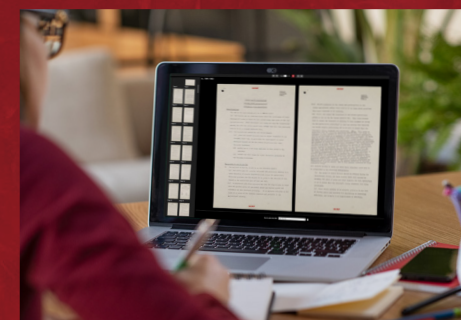
Technical: Incorporates our new and improved image viewer, with double-page spreads and quicker loading speeds.

Over 4 million records covering 1000 years of world history: from politics & warfare, to slavery & revolution.