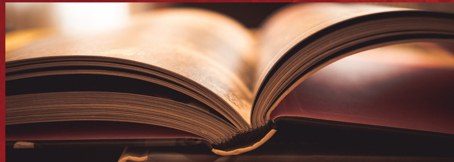
Lady Welby-Gregory’s personal library contains approximately 1,500 books and 1,000 pamphlets on a wide variety of topics. This collection comprises a carefully chosen selection of these books.

...in 19th and early 20th century Western philosophy