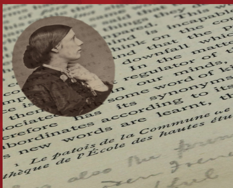
It encompasses more than 17,000 unique images.

19th and 20th Century Philosophy in Perspective contains 54 original monographs from Welby-Gregory’s personal library. It includes works by the likes of William James, Mary Everest Boole, Sir Henry Jones, and Henri Bergson on subjects as diverse as philosophy, theology, and philology.