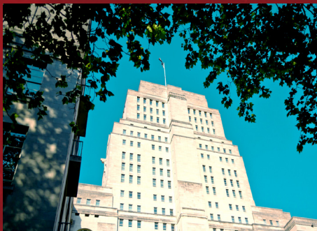
The collection was curated in association with Senate House Library at the University of London.

Welby-Gregory is most well-known for developing the theory of signification, which she defined in a 1911 Encyclopædia Britannica article as “the science of meaning or the study of significance.”