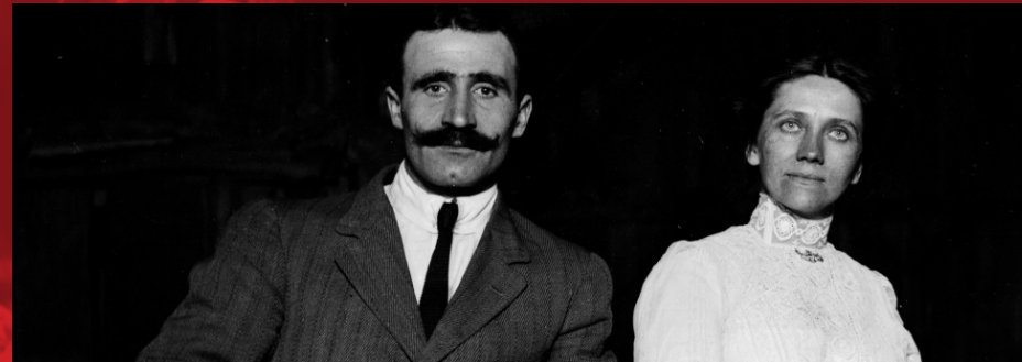
The Labour Party was founded in 1900 to represent the interests of trade unions and working-class voters. In political terms, it has often been characterised as a "broad church", encompassing a range of left and centre-left viewpoints.