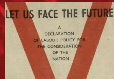
The materials shed light on the debates that eventually gave rise to the birth of the modern welfare state.

Over 4 million records covering 1000 years of world history: from politics & warfare, to slavery & revolution.