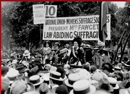
The collection is part of the wide-ranging Politics and Protest, 1102-1994 series.

British Labour Party Papers, 1906-1969 contains minutes and related records compiled by the Parliamentary Labour Party (PLP) during the period 1906-1969. These records cover the party's formative years, from its creation and early successes through the governments of Ramsay MacDonald and the wartime coalition to the Atlee administration and Harold Wilson's first premiership.