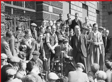
The collection is part of the wide-ranging British Communism, At Home and Abroad series.

These records include minutes, circulars, and reports from various events and bodies that were concerned with science and its implications for socialism.