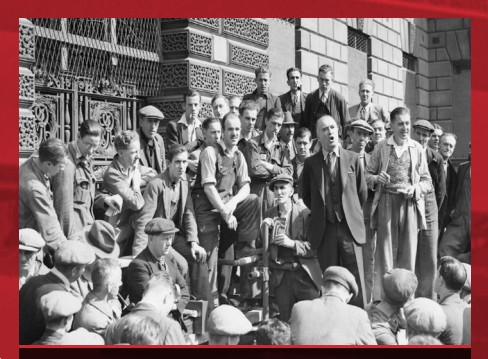
The collection is part of the wide-ranging British Communism, At Home and Abroad series.

The pair alleged that members of the Communist Party of Great Britain (CPGB) had engaged in "a conspiracy to defraud" in the 1959 elections of the Electrical Trades Union (ETU), a relatively success-