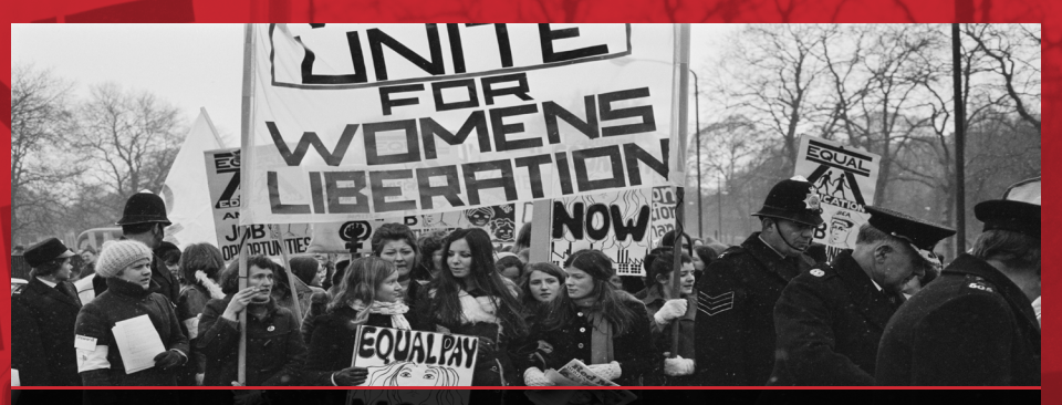
Karl Marx's analysis of the gendered division of labour under capitalism suggested that women faced a unique oppression—a specific economic exploitation linked to unpaid labour in the domestic sphere.