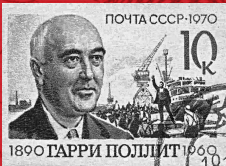
It encompasses more than 15,000 unique images.

The majority of the documents cover the Sino-Soviet split and the Chinese-Indian disputes of the 1960s and 1970s.