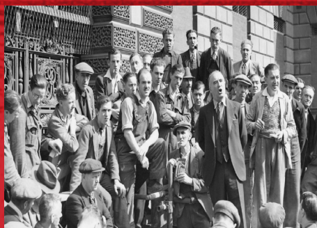
The collection is part of the wide-ranging British Communism, At Home and Abroad series.

Communists and the Cold War, 1944-1986 contains reports and other records compiled by the Communist Party of Great Britain's (CPGB) International Department between 1944 and 1986—a period which begins immediately after the dissolution of the Comintern and ends shortly before the collapse of the Soviet Union.