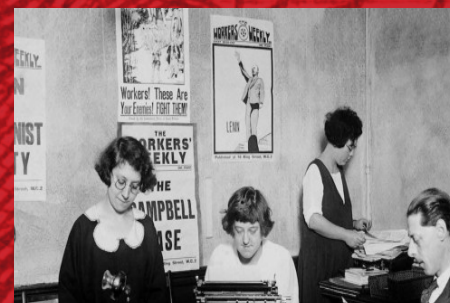
Professor Morgan has written 3 contextual essays to accompany the collection, including a detailed guide to the International Department.

There are also materials relating to Soviet satellite states in Eastern Europe, the left in Western Europe, and anti-colonial movements in the developing world.