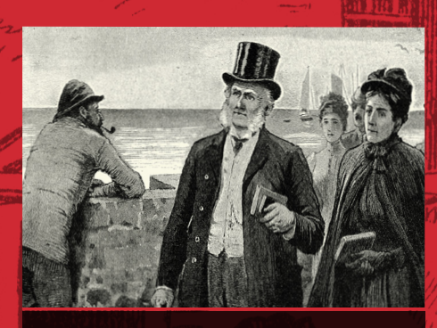
Research: Provides students and researchers with an opportunity to study debates between different denominations of Methodism.