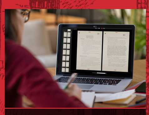
Technical: Incorporates our new and improved image viewer, with double-page spreads and quicker loading speeds.

Over 3 million records covering 1000 years of world history: from politics & warfare, to slavery & revolution.